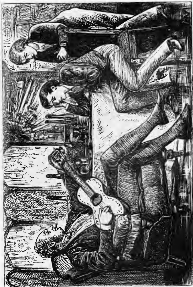
"He had had a guitar on his knees and flipped a string." CHAP. 18.